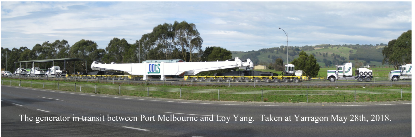
The generator in transit between Port Melbourne and Loy Yang. Taken at Yarragon May 28th, 2018.